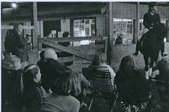
It was a cold day! Many attendants wore coats and hats.